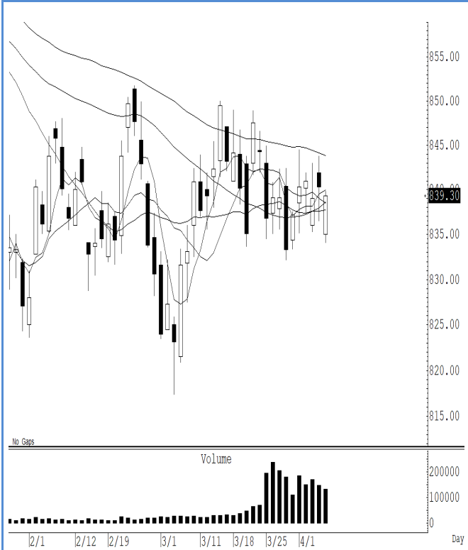
S50M24 (Close 839.30 Chg -1.0)